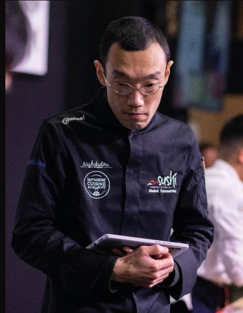
3 Logo embroidered on the Chefs Jacket worn by the judges