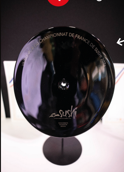
4 Logo on the Championship Winner Cup