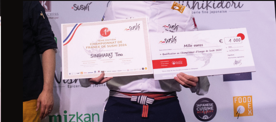
10 Presentation of the Championship cups and prizes to the winners