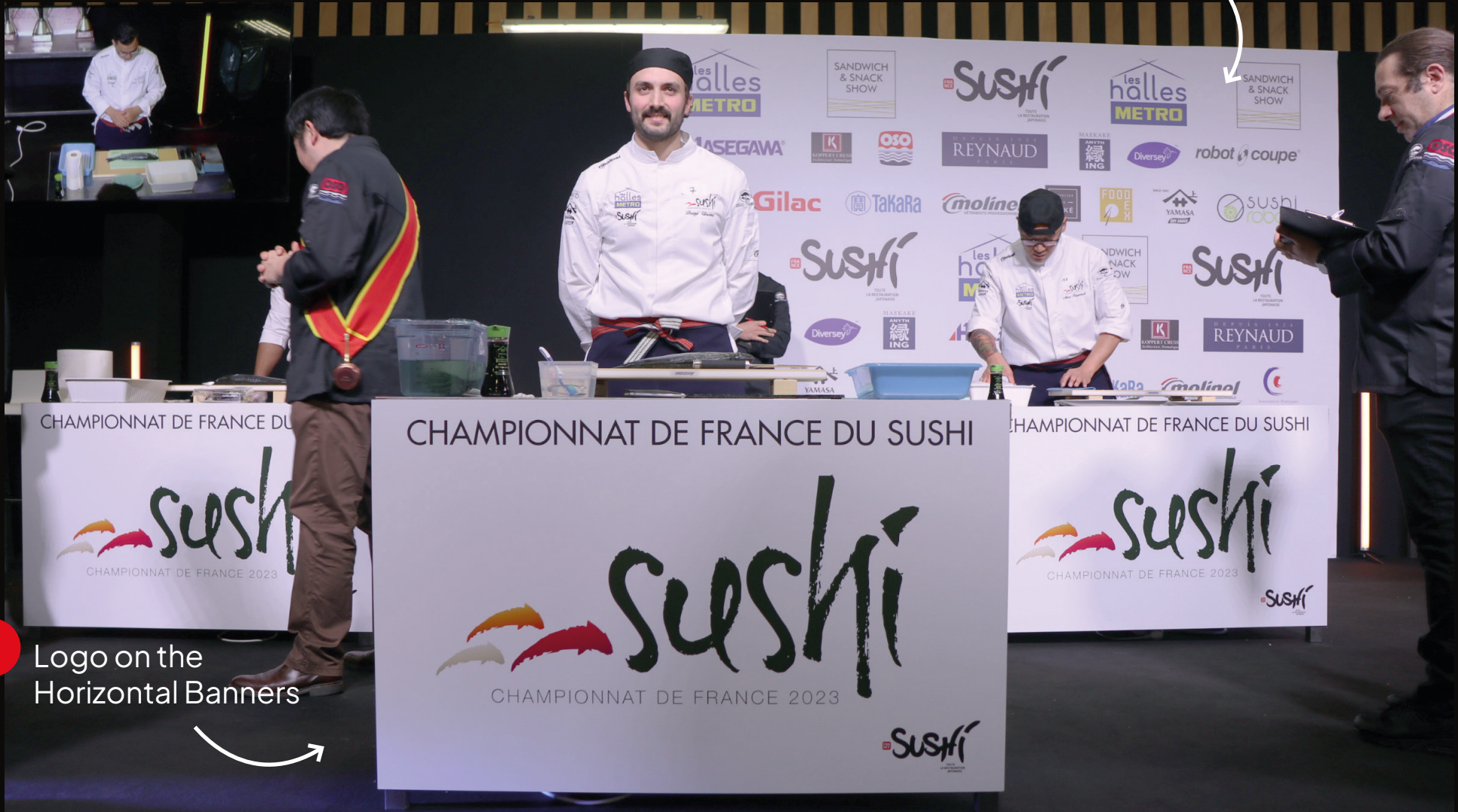
5 Logo on the Horizontal Banners